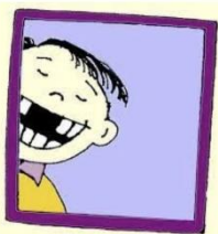
Picture Retake Day