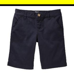
Navy Uniform Shorts *Also called: Bermuda Shorts or Walking Shorts