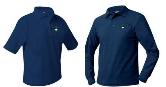
Navy Blue Golf/Polo Shirt (Long or Short Sleeves)