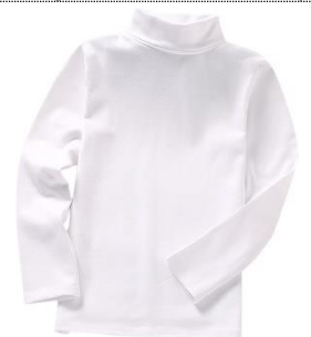
White Turtleneck / Mock Turtleneck (Long Sleeves)