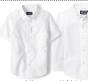
White Dress Shirt/Blouse (Long or Short Sleeves)