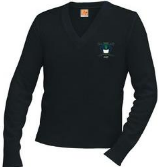
Navy V-Neck Sweater