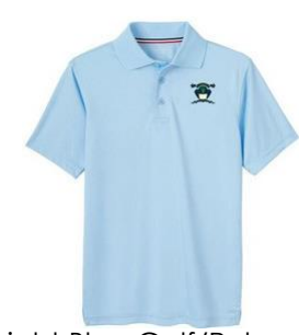
Light Blue Golf/Polo Shirt (Short Sleeves)