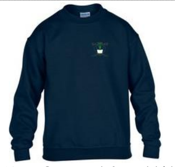
Navy Crewneck Sweatshirt